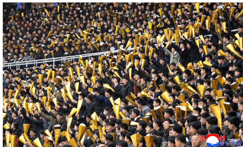
The 31st Pyongyang International Marathon takes place at Kim Il Sung Stadium on April 6.