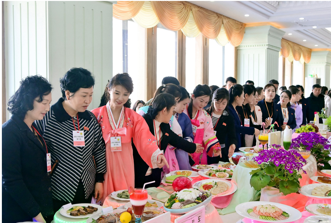
Visitors look round the dishes presented to the festival.

Kangwon Province presented Wonsan boiled rice with clam meat, while Kaesong City exhibited five-colour rice cake dumpling and other typical traditional dishes and such local specialties as steamed chicken and red insam, insam jam and insam tea, adding national colour to the