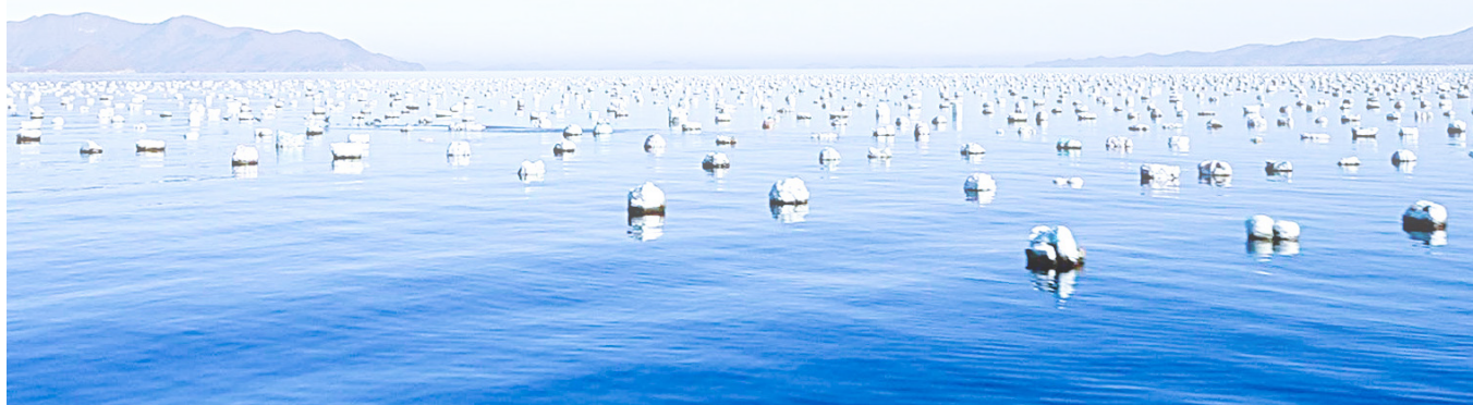
The Wonsan Seafood Production and Processing Station increases mussel production by breeding mussels well.