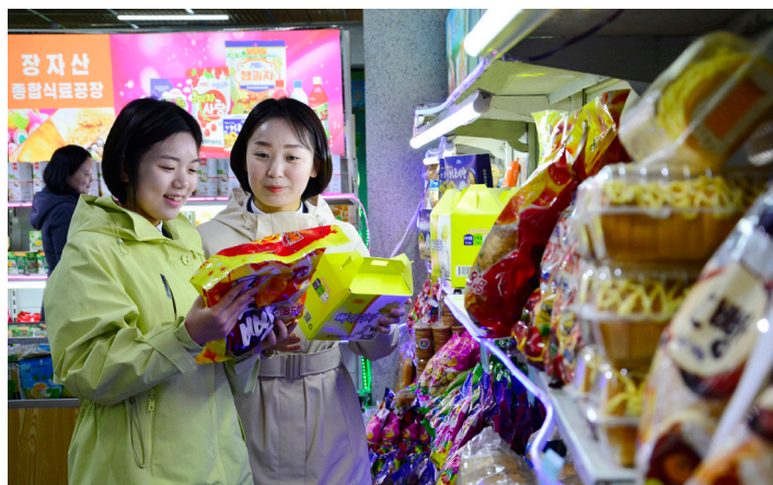
Visitors show keen interest in exhibits at the national foodstuff exhibition-2025.