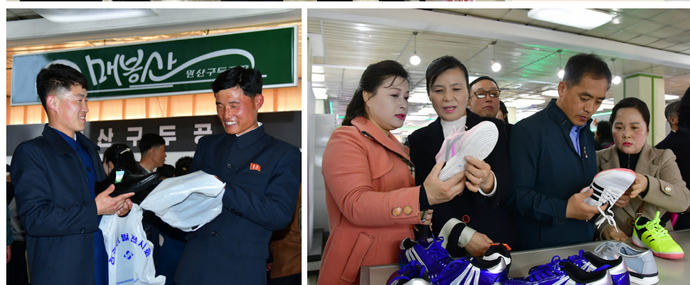
The 2025 Spring National Footwear Exhibition takes place at Pyongyang Department Store No. 1 between April 3 and 10.