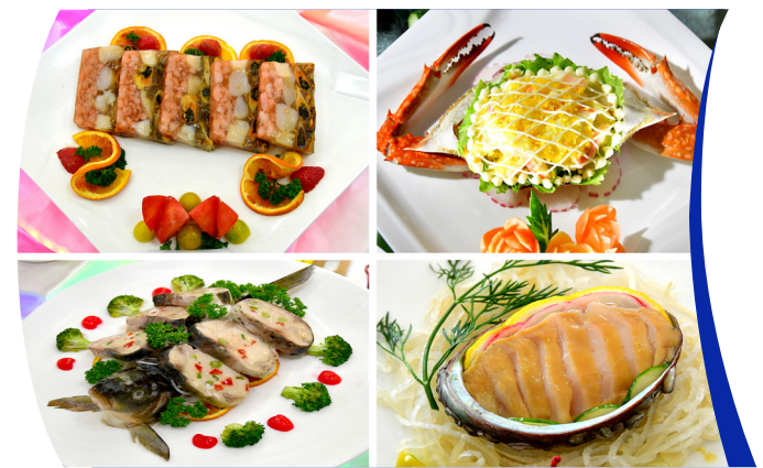
Some foods on display in the festival.