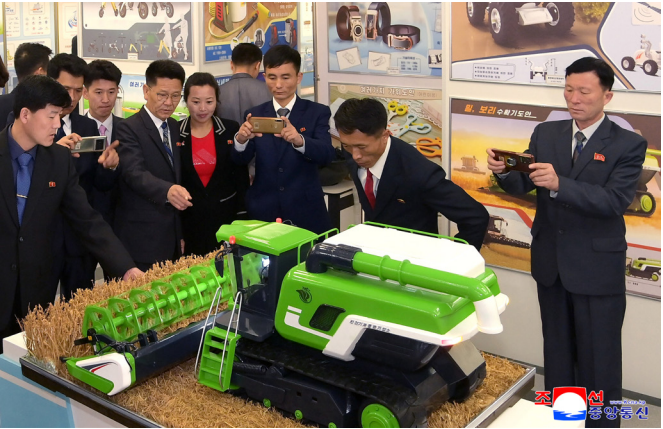
A national industrial design exhibition is held with due ceremony at the Industrial Design Exhibition House of the Central Industrial Design Bureau on April 8.

KCNA A national industrial design exhibition for celebrating April 15, the birthday of President Kim Il Sung, opened with due ceremony at the Industrial Design Exhibition House of the Central Industrial Design Bureau on April 8. At the venue of the exhibition there are photos of the respected Comrade Kim Jong Un giving field guidance at various sectors of the national economy. On display at the exhibition on the theme of “New era of great change and industrial design” are 590-odd industrial designs of various kinds personally guided by Kim Jong Un, over 800 designs and models produced by experts, students and fans, products presented by more than 30 production units including the Sinuiju Cosmetics Factory and the Ryuwon Footwear Factory, books related to industrial design and multimedia presentations. Present at the opening ceremony were officials concerned and officials and creators in the field of industrial design. An opening address was made.