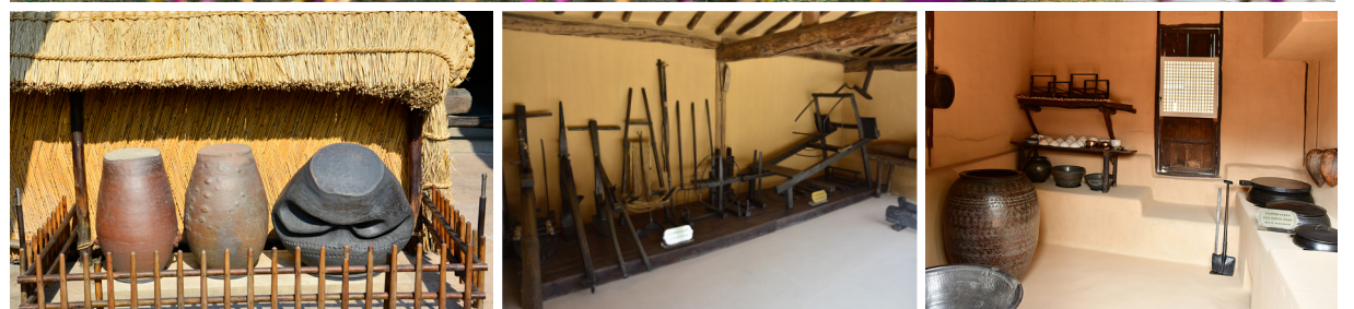
President Kim Il Sung's birthplace at Mangyongdae and some of historic materials preserved in his home.