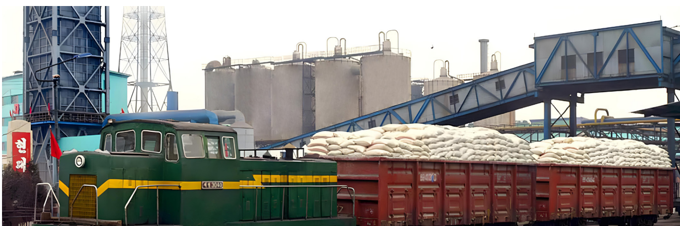
Different sectors of the national economy carry out the first quarterly plan, providing a sure guarantee for the implementation of the five-year plan.