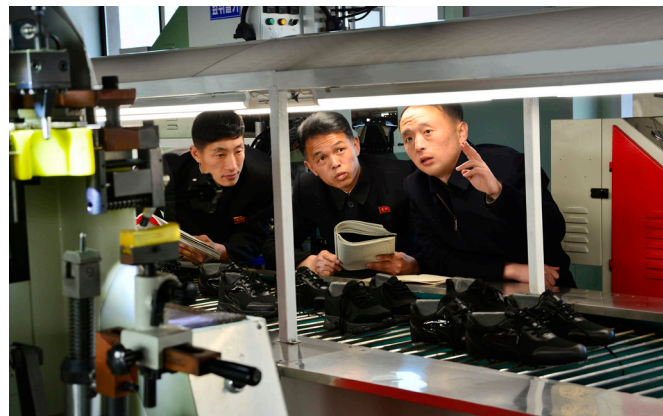
Officials of the high-tech products manufacturing company under the North Hwanghae Provincial Commission of Science and Technology work to solve problems arising in practice.

The employees of the company readily solve technical problems arising in other fields as well as their majors, and all of them have the ability to carry out every task from design to