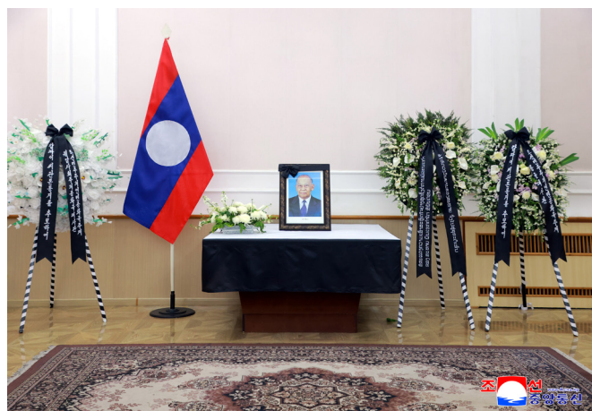
Officials of the Party and power organs, working people's organizations and ministries visit the Laotian embassy in Pyongyang on April 6 to mourn the death of Comrade Khamtay Siphandone.