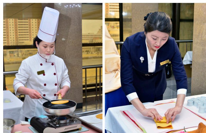
Snapshots from the demonstration of excellent chefs and waitresses conducted as part of the 28th National Cooking Festival.

demonstration was always crowded with students who specialize in culinary art as well as many cooking fans throughout the festival.